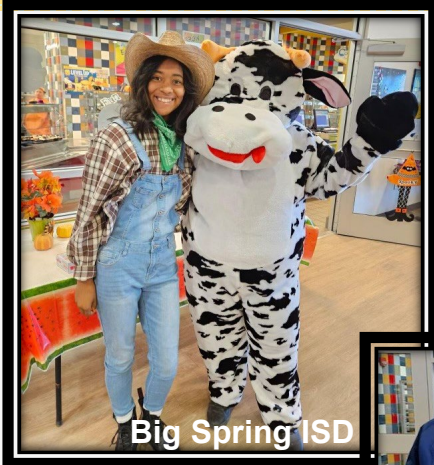
Big Spring ISD

Staff at Big Spring ISD and Northside ISD captured the imaginations of their students with Farm Fresh costumes and aprons worn during nutrition education